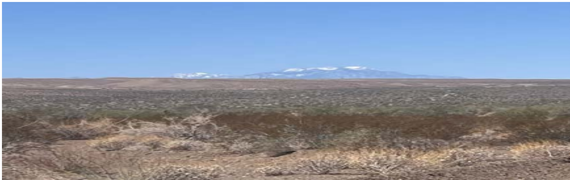
The Salton Sea, is now a park and camping ground, yet whispers of its fashionable past and wealthy visitors who lounged on their “boats” and partied till sunrise.