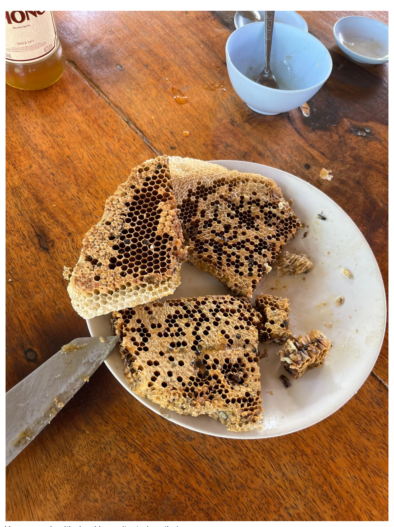
Honey comb with dead bees (tasted earthy)