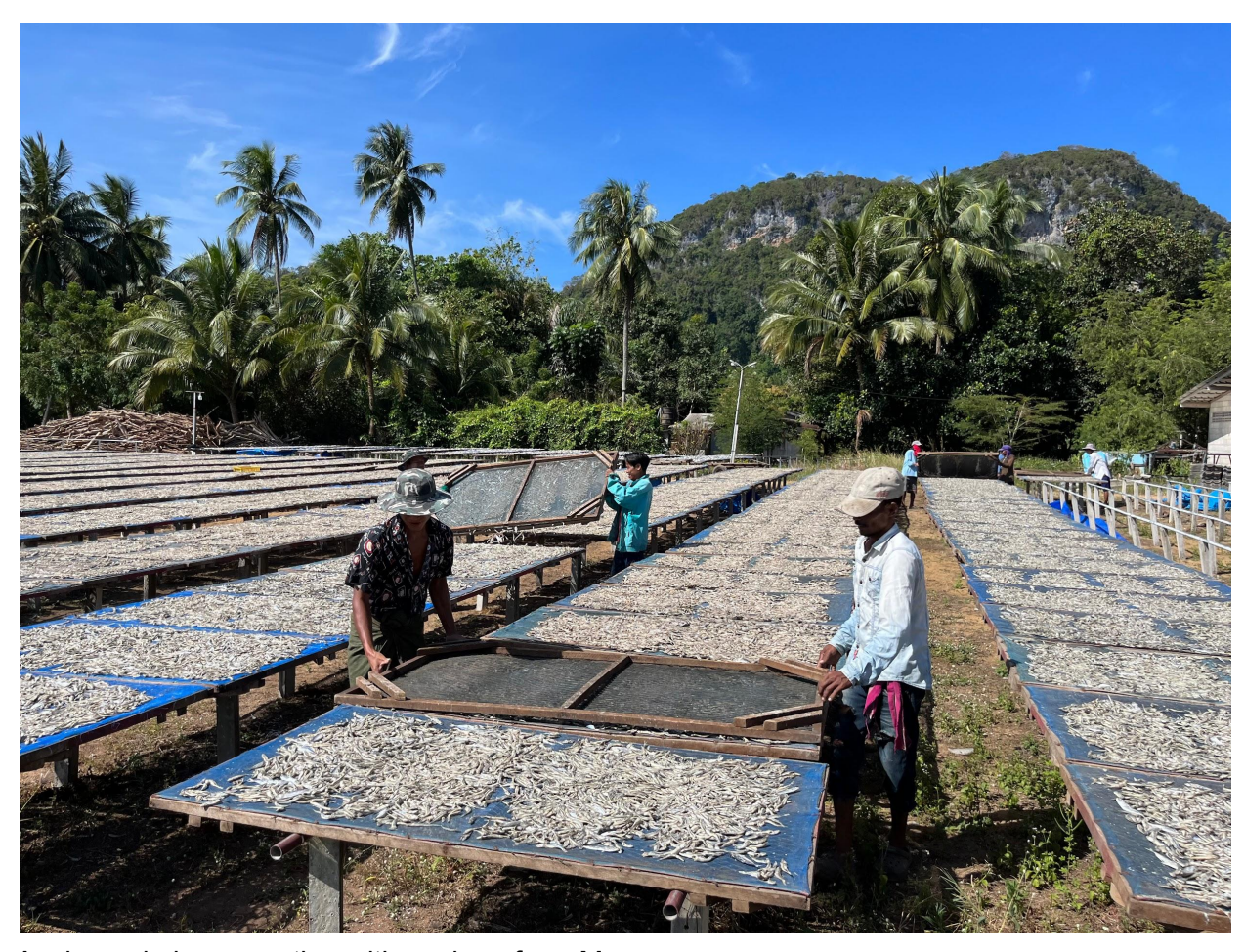
Anchovy drying operation with workers from Myanmar