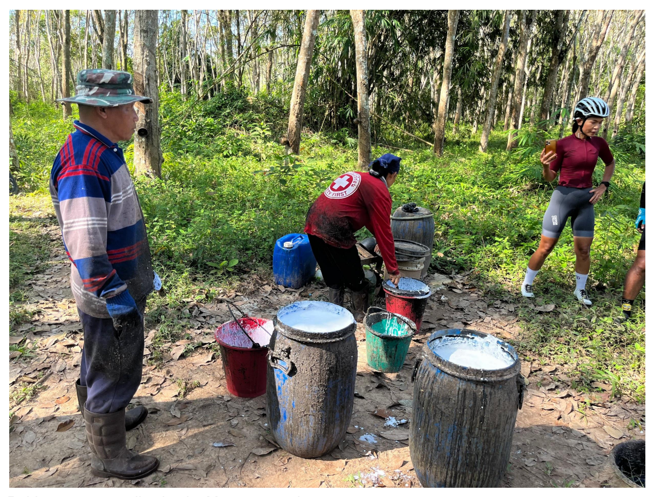
Rubber tree sap collection by Myanmar worker

Another wonderful surprise was a visit we made to a school near Larn Thong Beach. With the approval of the teachers, we visited three classrooms of 1st to 3rd grade students. The children overcame their initial shyness and charmed us all. We dug deep into our memory banks to sing a few songs, such as "Old McDonald," with the children. Then one girl shared a poem and one girl sang a solo song for us. When we eventually donned our helmets and started pedaling away, the adorable children leaned out the classroom windows, waved, and yelled "Goodbye."