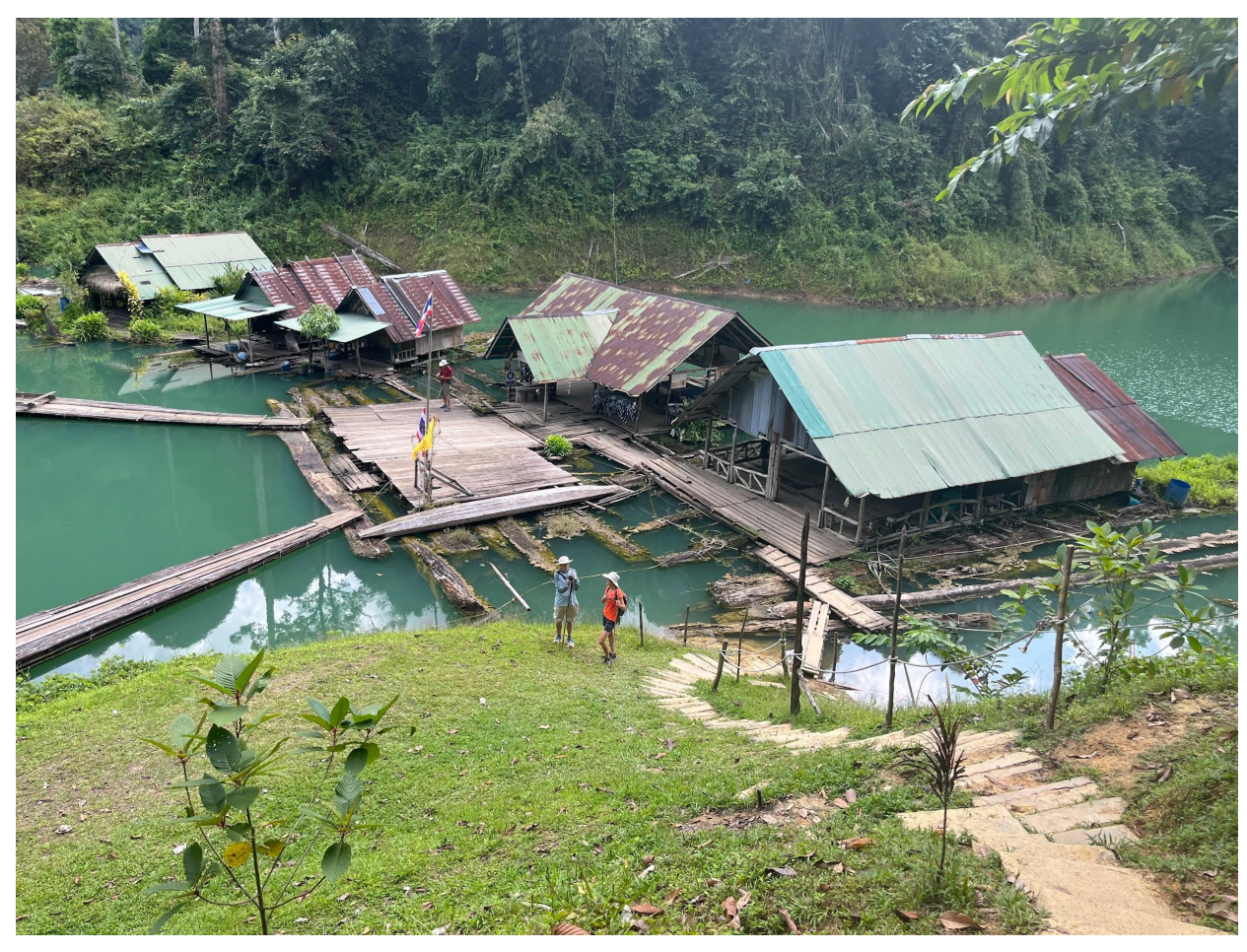
Hike to Pakarang Cave during rest day on Cheow Lan Lake