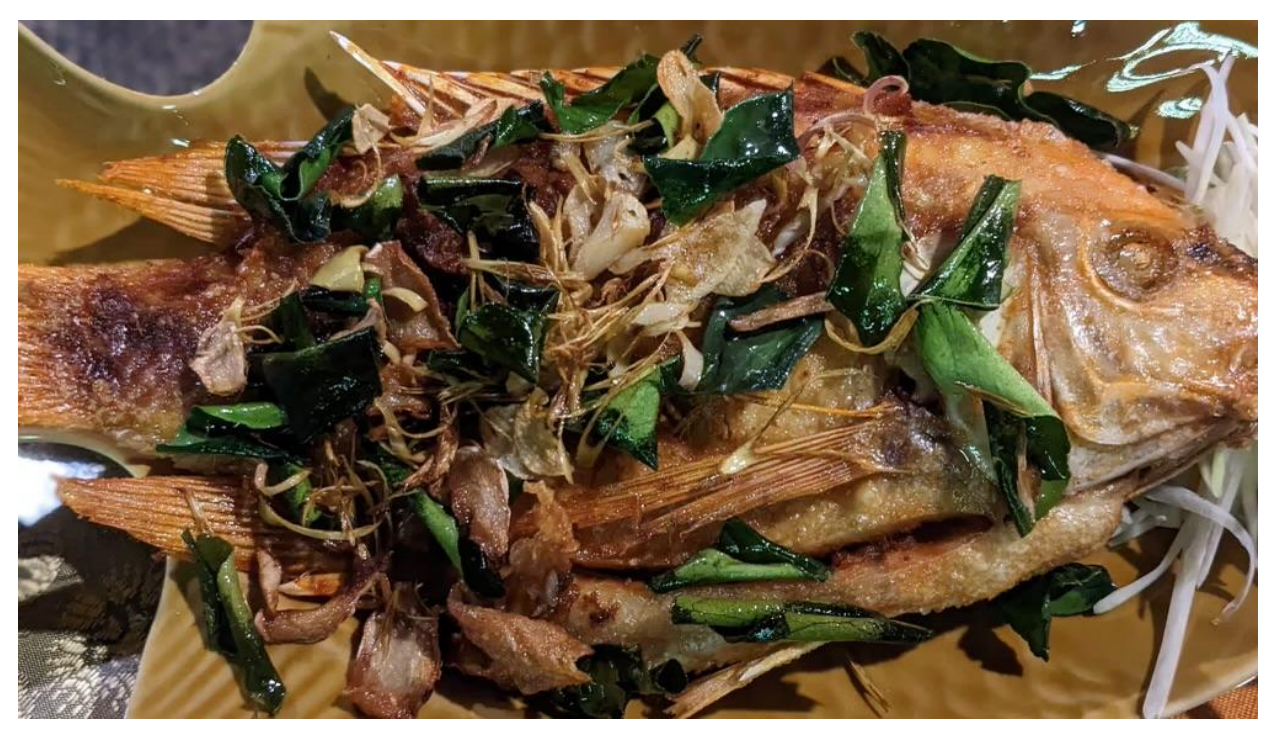
Fried whole fish with crispy basil

Thai food was of course a focal point and a highlight for most of us. While Thai food can be quite spicy, our guides made sure that local restaurants kept heat to a minimum for us. Overall, the food was delicious and we ate heartily...and frequently. Most of the dishes served were easily recognizable, such as chicken and pork curries, brothy soups, and seafood dishes. A couple of the more unusual dishes, at least to us, are shown in pictures below.