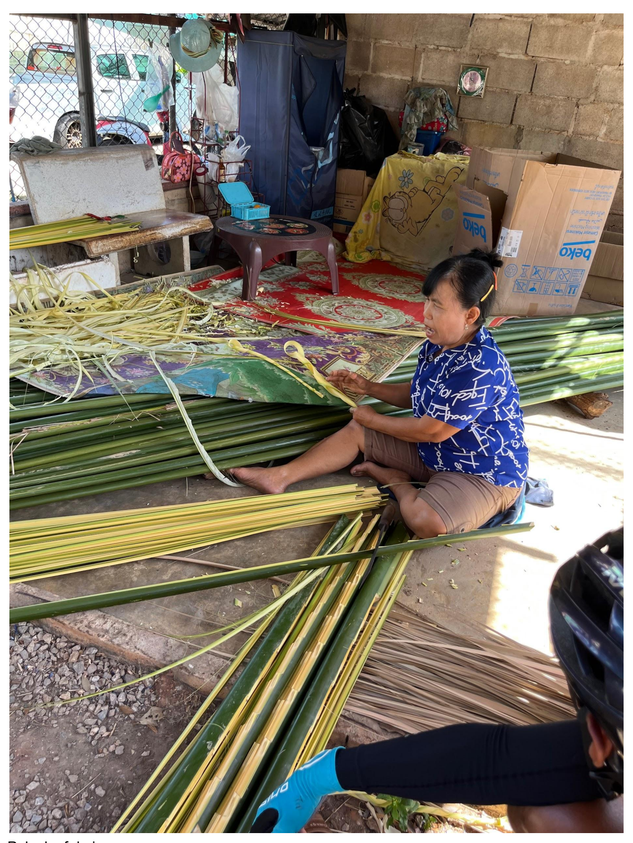
Palm leaf drying