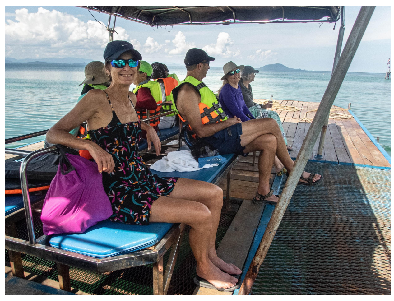
Snorkeling trip on Koh Talu Island