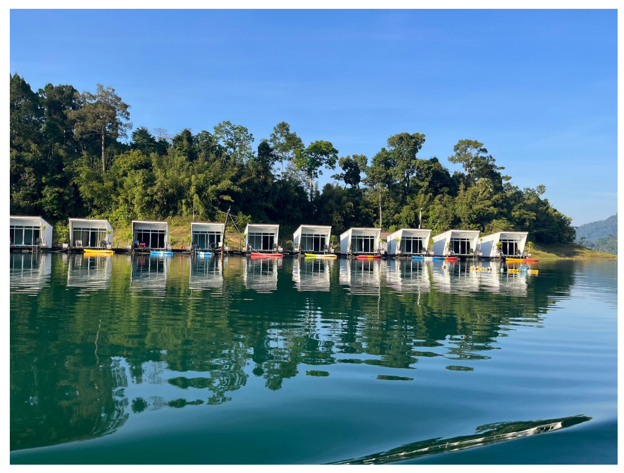
Pontoon lodging at Cheow Lan Lake